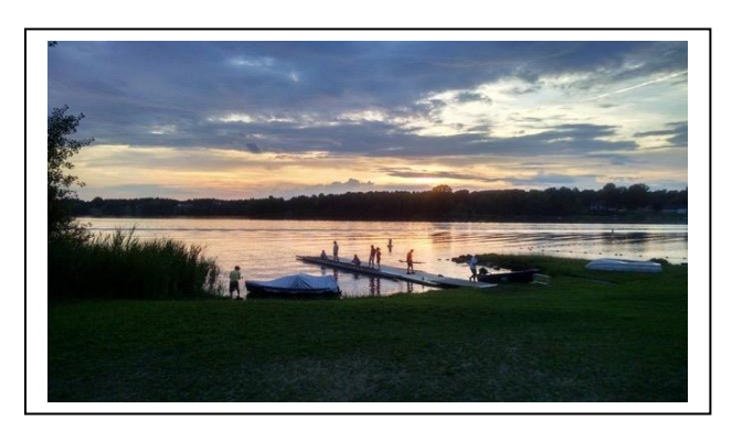
Grateful Oars Rowing Club, Norwood, NY